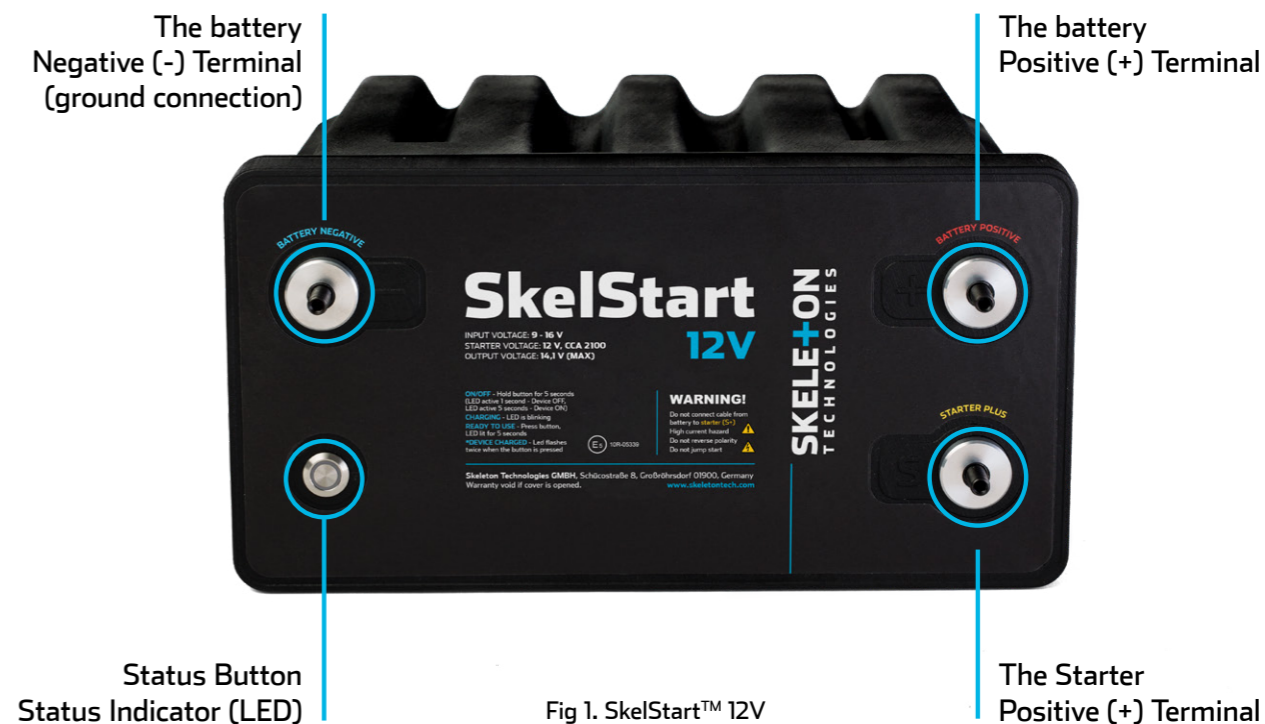
Fig 1. SkelStart™ 12V